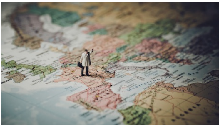
Affluents travel the world for best medical care.

Most stay in a hotel for a few days, but there has been a recent trend in long-term stays at luxury hotels.