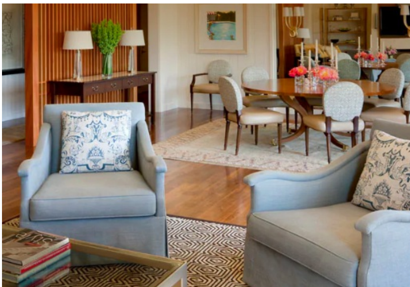
Villas at Rosewood Sandhill.