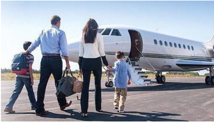
Sentient Jet aids in medical care.

Sentient has renewed its relationship with PinnacleCare for a second year, offering clients access to medical evacuation and health advisory services. For travelers with chronic illnesses, travel can be a stressful undertaking, leading to a number of healthcare-focused hospitality alliances.