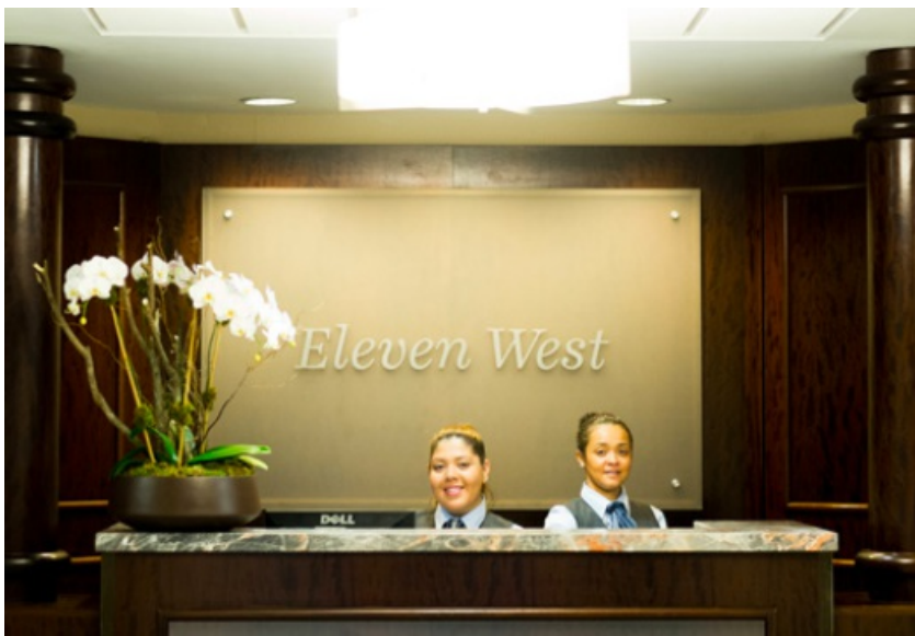
Eleven West at Mount Sinai.

"What this means for the medical facilities is that first they have to have the appropriate infrastructure including highly trained doctors with experience as well as highly trained staff. Further, the facilities need to be state-of-art and need to be accessible in order to attract those type of consumers."